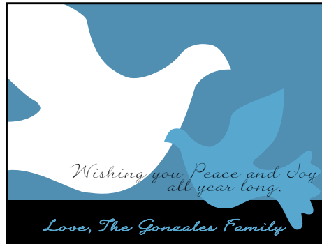
*Sample label design*

The holidays are approaching quickly, and we just wanted to remind you to place your custom label or hand-painted wine orders as soon as possible. We have many great new Christmas and Holiday designs to choose from, so come in to one of your locations, give us a call, or visit us online to place your orders. These bottles make a wonderful holiday gift idea and can be fully personalized to show your friends and family that you had them in mind this holiday season. Availability is limited due to the busy season so all orders MUST be in by December 10th for shipping availability. Don't wait until its too late- order now!